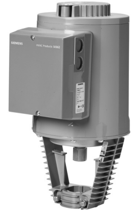
Flowrite SKB/SKC Valve Actuator.

24 Vac, Floating Control Spring Return or Non-Spring Return